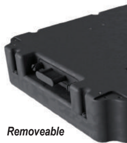
Removeable SSD Option